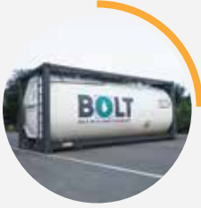
T11 Standard T14 Lined

Hazardous, Non-Hazardous, Specialty Chemicals, Corrosive